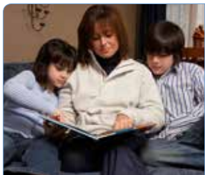
Meet Ellen. She is going through a divorce and has two young children. Ellen calls her GuidanceResources 24/7 toll-free line.

Here is a common scenario to help you better understand how the GuidanceResources program works and how it can help: